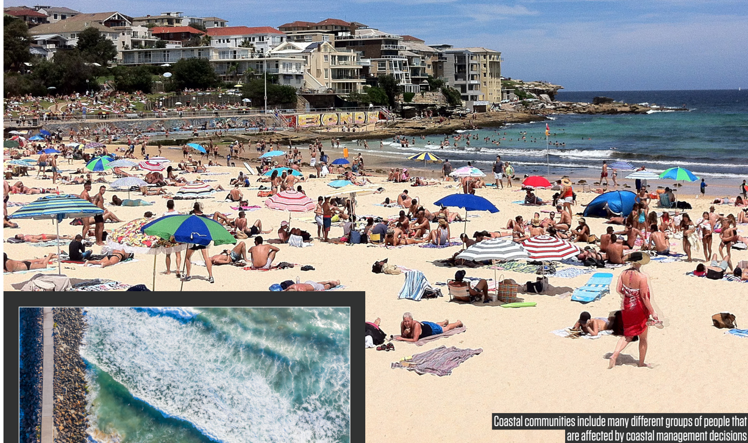
Coastal communities include many different groups of people that are affected by coastal management decisions