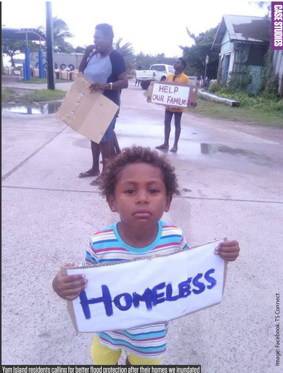
Yam Island residents calling for better flood protection after their homes were inundated