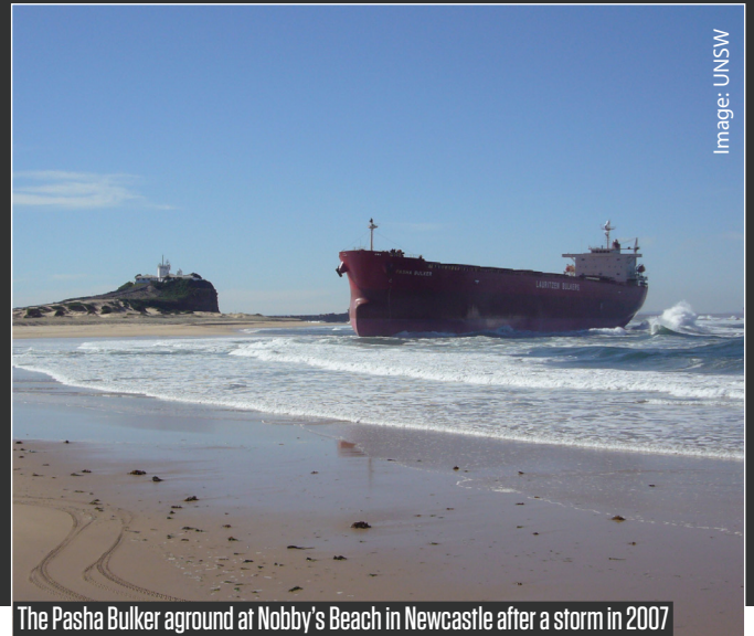
The Pasha Bulker aground at Nobby's Beach in Newcastle after a storm in 2007

The UNSW Sydney MyCoast Study used surveys to explore perceptions of coastal communities in NSW in regards to how the impacts of coastal storms and sea level rise will affect their use of the coast in the future. This includes how communities see the