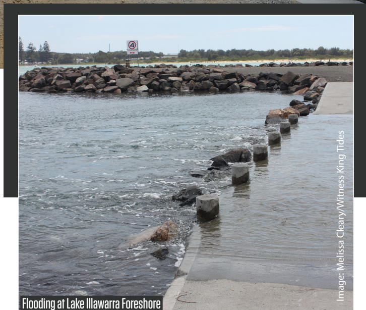
Flooding at Lake Illawarra Foreshore

Warming oceans and melting of polar ice are predicted to cause sea-level rise that will likely lead to the recession of shorelines and the permanent loss of beaches.