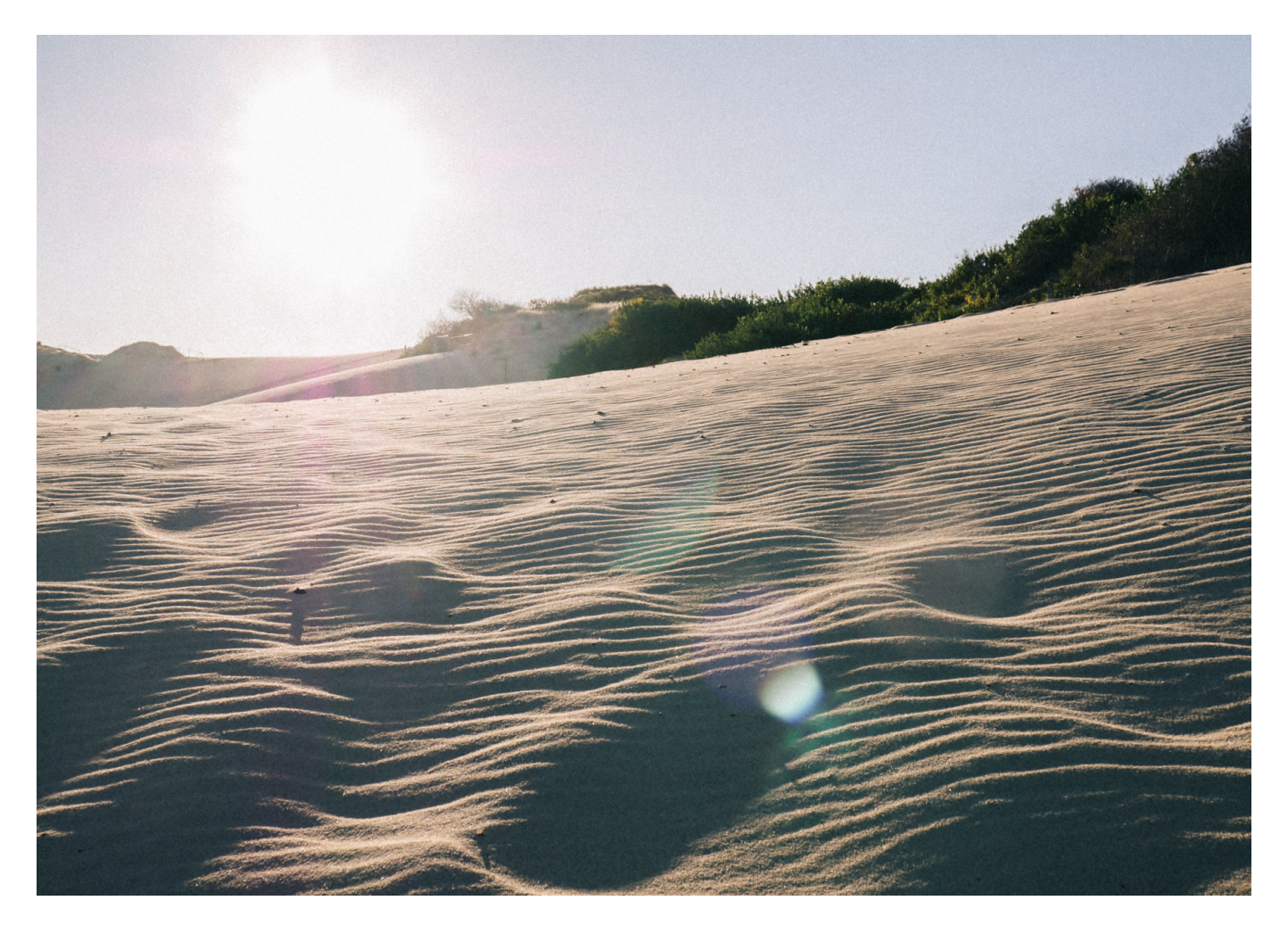
UNSW's Indigenous strategy

UNSW Arts, Design and Architecture Kensington and Paddington campuses are built on Aboriginal Lands. We pay our respects to the Bidjigal and Gadigal peoples who are the Custodians of these lands. We acknowledge the Aboriginal and Torres Strait Islander peoples, the First Australians, whose lands, winds and waters we all now share, and pay respect to their unique values, and their continuing and enduring cultures which deepen and enrich the life of our nation and communities.