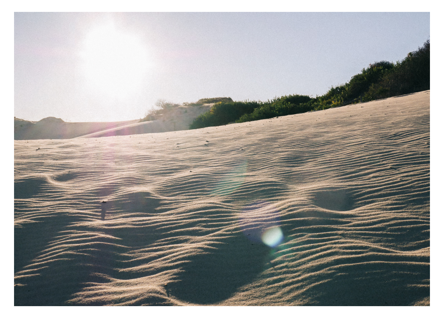
UNSW's Indigenous strategy

UNSW Arts, Design and Architecture Kensington and Paddington campuses are built on Aboriginal Lands. We pay our respects to the Bidjigal and Gadigal peoples who are the Custodians of these lands. We acknowledge the Aboriginal and Torres Strait Islander peoples, the First Australians, whose lands, winds and waters we all now share, and pay respect to their unique values, and their continuing and enduring cultures which deepen and enrich the life of our nation and communities.