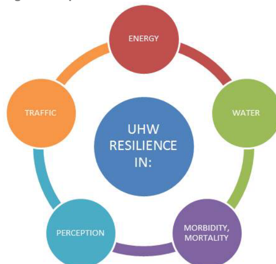
Figure 3 Impact indicators of UHWs

3. An evaluation tool for retrofitting can illuminate aspects such as social feasibility, local vulnerability and number of adaptive opportunities available.