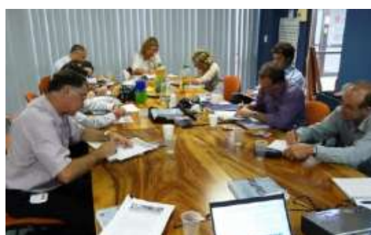
Above: Workshop at Coffs Harbour

Of the 43 Area Health Services staff who took part in these capacity building workshops: