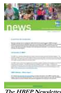
The HBEP Newsletter

The Healthy Built Environments Program logo was designed by Lawton Design to embody the key messages of the Program. Other branding and promotional work included a brochure, and presentation and report templates.