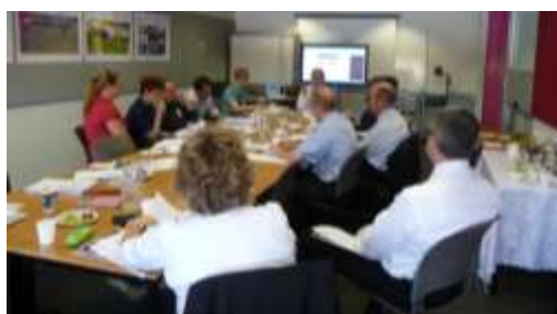
Above: Inaugural Advisory Board meeting on 22 March