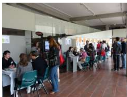
Above: University of NSW Open Day 2010