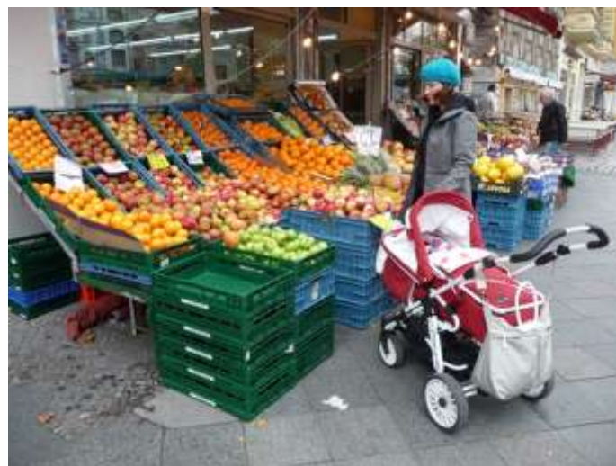
Above: Access to Healthy Food is Essential for a Healthy Built Environment