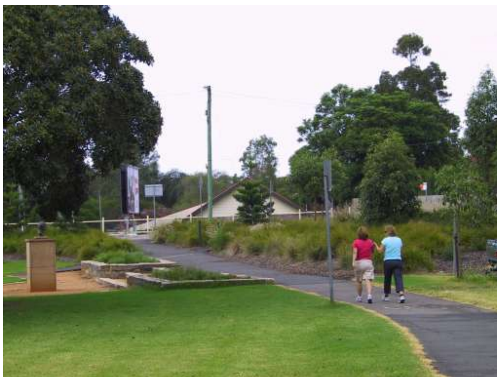
Above: The Importance of Infrastructure for Walking

Further information about projects listed in this Annual Report can be found on the Healthy Built Environments Program website: http://www.fbe.unsw.edu.au/cf/hbep/