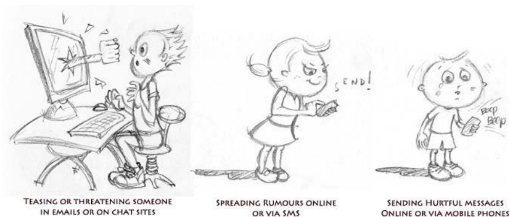
Figure 1 Joint Select Committee on Cyber-Safety 2011 study graphic definitions

In the survey for children aged 13 years and older, cyberbullying was not defined, rather, a series of questions were posed relating to behaviours (pp 551–552):