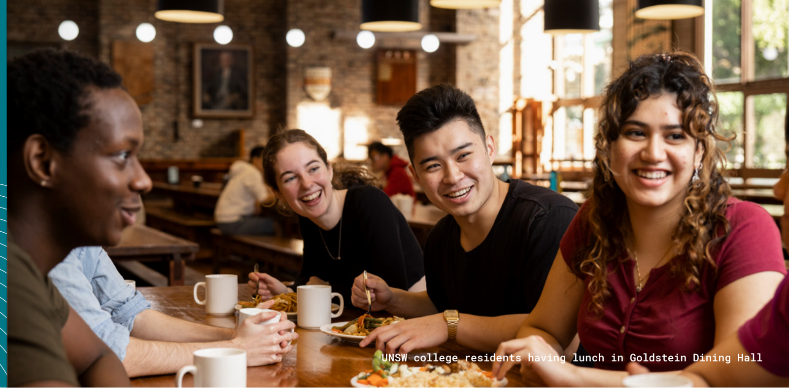
UNSW college residents having lunch in Goldstein Dining Hall

Most students at UNSW live off campus. Live by the beach or in the beautiful suburbs surrounding the UNSW campus, such as Coogee, Clovelly, Maroubra and the iconic Bondi Beach. Sydney is a safe, accessible and vibrant city, with public transport connecting the UNSW campuses, beaches and city centre.