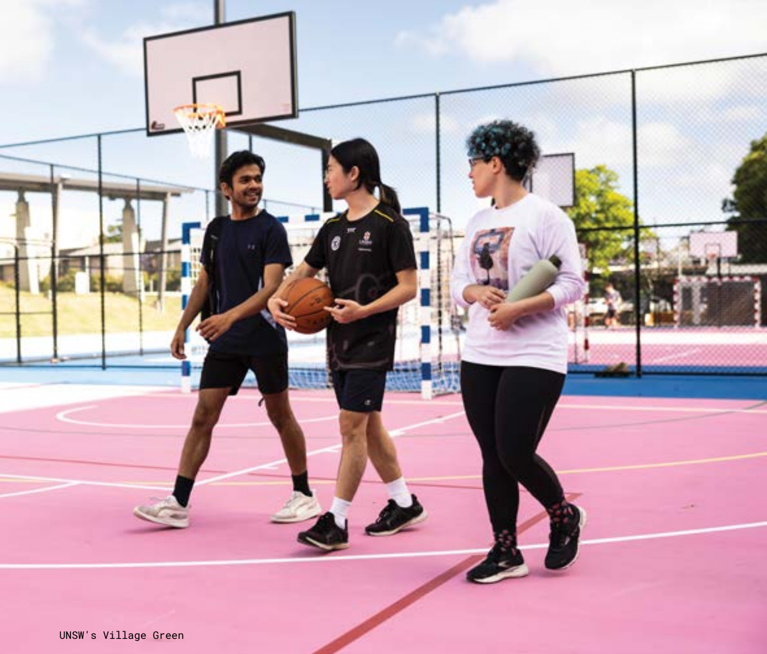
UNSW's Village Green