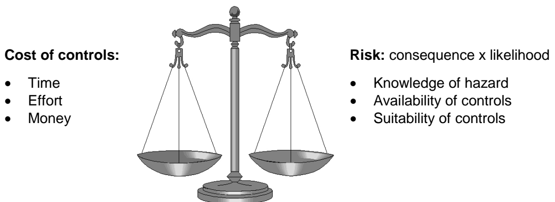
Figure 3: How to determine what is reasonably practicable

In all other cases the cost, in terms of: time; effort; and money; of implementing a control may be taken into account when deciding whether it's reasonably practicable. However, cost alone cannot be used as a reason for doing nothing.