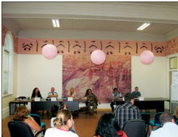
Open Yarnin Community Forum

Following the forum, a BBQ, funded by Randwick City Council was held for participants to meet with panel members. A follow up meeting with the La Perouse Aboriginal Youth Haven will be organised soon to discuss what future actions KLC can assist with regarding legal issues for Indigenous youth.