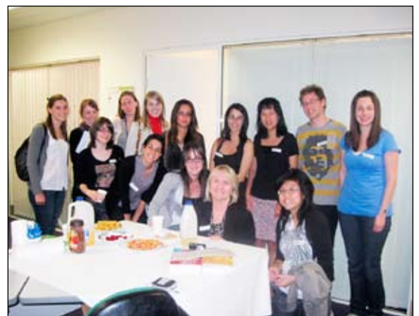
KLC students at Prince of Wales Hospital

Students from the Kingsford Legal Centre and the Prince of Wales Hospital Social Work Department spent a day in each others' shoes once again following a successful partnership in 2008. Three social work students from Prince of Wales Hospital and 2 from the UNSW CD Project visited KLC to gain a better understanding of how law and social work often interact with each other. Staff and students from KLC spoke about the different aspects of law that we often deal with, as well as how to make quick and better referrals for clients to ensure they receive the appropriate services. On 29 September, ten KLC students spent a day in the life of a social worker at the Prince of Wales Hospital Social Work Department. Students were given an insightful tour of the hospital and the coordinators and team leaders spoke about the work involved in each of the four areas of work including aged care, acute care, spinal and oncology. All students who participated in the exchange had extremely positive feedback, noting that the experience provided them with a great insight into the role of social workers and lawyers and how they often need to collaborate to provide a more holistic approach to all their clients.