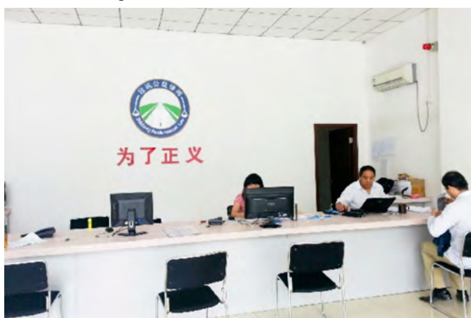
The advice room at Zhicheng Public Interest Law Centre in Beijing, China