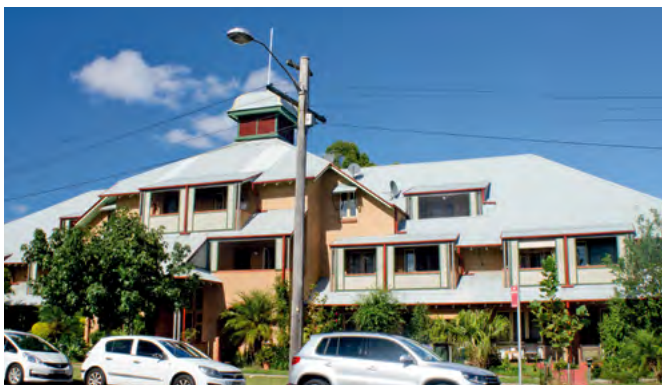
Daceyville Social Housing

KLC, NACLC and the Human Rights Law Centre collaborate on United Nations Human Rights Council Statement for Australia's mid-term Universal Periodic Review.