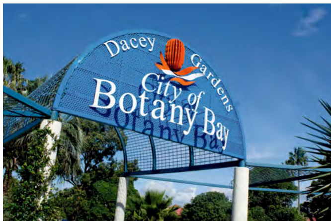
Daceyville Social Housing