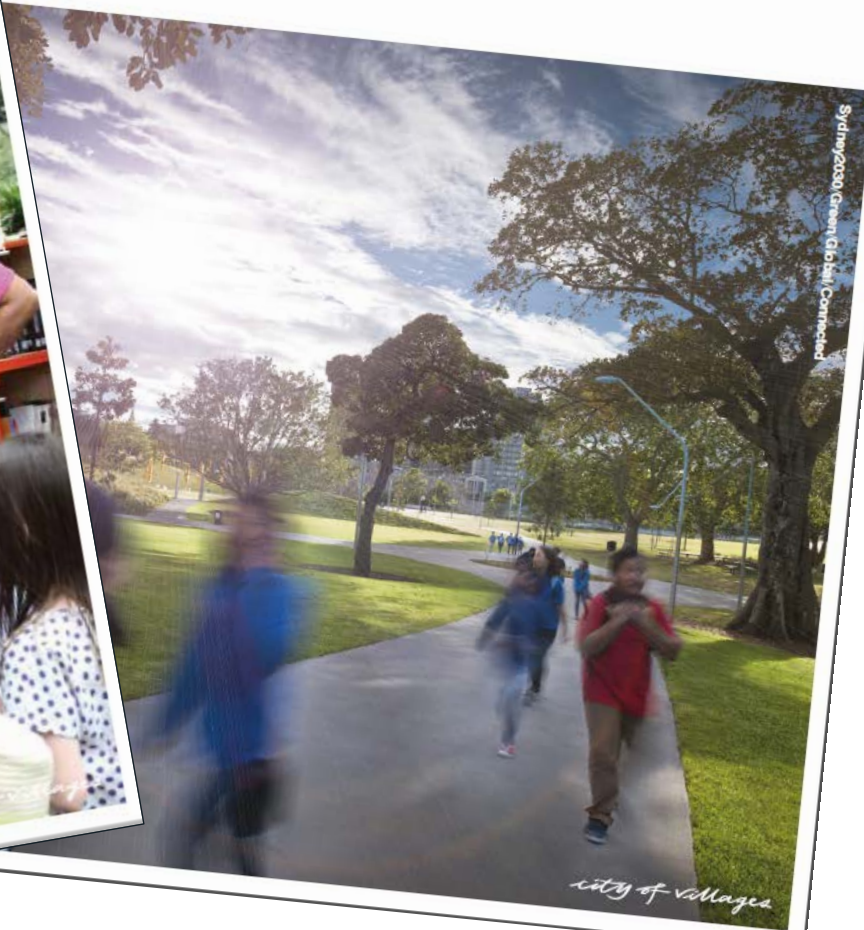
Sydney 2030 Green Global Connected

Social Sustainability Discussion Paper March 2016