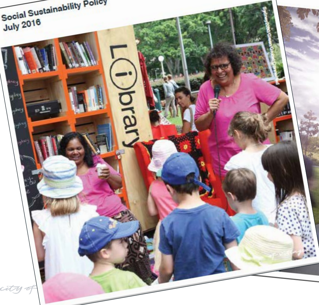
Sydney 2030 Green Global Connected