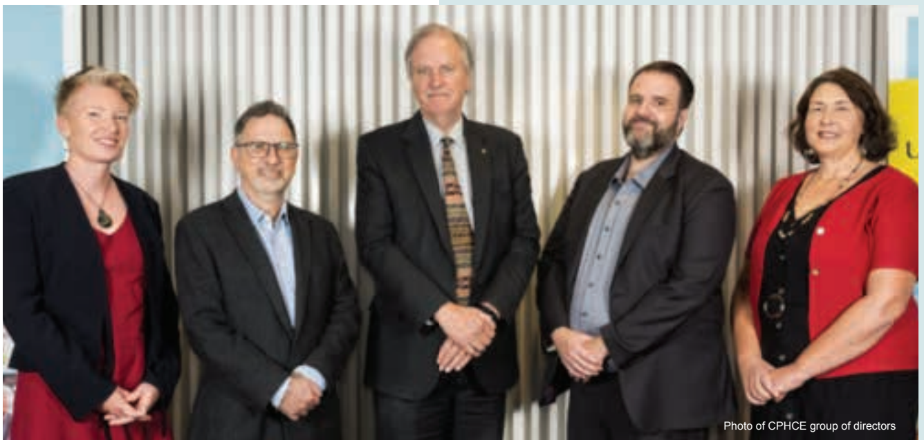
Photo of CPHCE group of directors