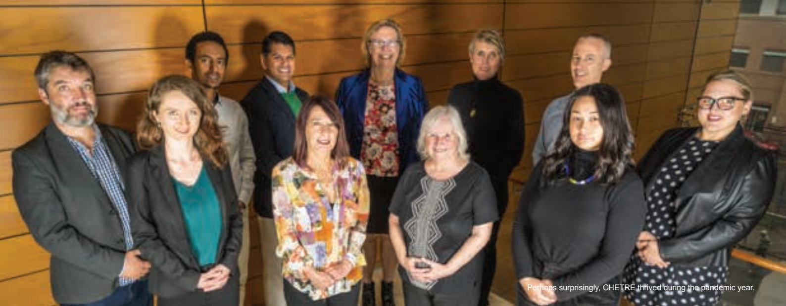
Perhaps surprisingly, CHETRE thrived during the pandemic year.