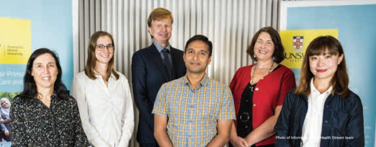
Photo of Informatics and eHealth Stream team