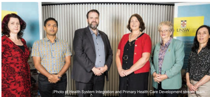
Photo of Health System Integration and Primary Health Care Development stream team.

Innovative Models Promoting Access-to-Care Transformation (IMPACT) is a five-year research program spanning three Canadian provinces and three Australian states through which PHC innovations were designed, implemented, and evaluated. The focus was on improving access to appropriate primary health care for vulnerable populations. In each region, decision makers, researchers, clinicians and, in some contexts, community members, formed Local Innovation Partnerships (LIPs) to support design and implementation of the intervention and guide local research activities. The local site in NSW was in south-west Sydney where a partnership involving UNSW, SWSPHN and SWSLHD worked together to improve access to community and allied health services for people with type 2 diabetes in general practices in disadvantaged communities. Levesque et al.'s conceptual framework of access to health care informed the design, implementation and evaluation.