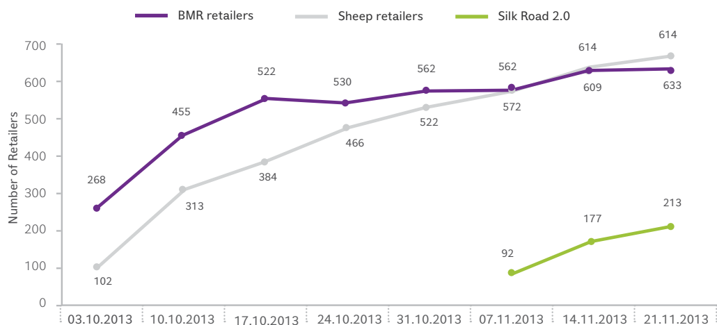
Figure 3: Total number of retailers identified by time point and marketplace across all shipping destinations, October to November 2013

Table 4 outlines the number of retailers identified by marketplace over the monitoring period specifically willing to ship to Australia by substance for sale. Across all three marketplaces, pharmaceutical drugs (primarily benzodiazepines, pharmaceutical opioids and sildenafil) and cannabis were the two most commonly sold substances. Cocaine, MDMA, NPS and methamphetamine largely followed these two substances, with slight variations in order across marketplaces.