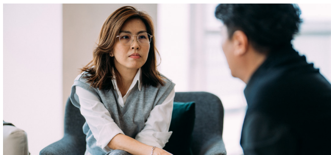
Black Dog Institute

Our ability to deliver world-class medical education and significant healthcare breakthroughs couldn't be achieved without the strength of our affiliated medical research institutes. Explore our UNSW Medicine & Health partnerships and how they contribute to improving health outcomes in Australia and beyond.