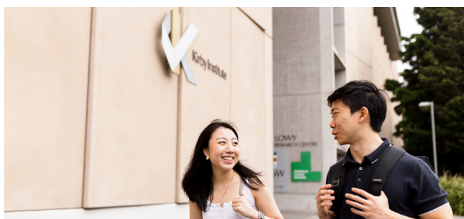
The Kirby Institute