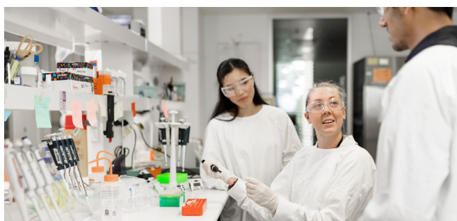
Garvan Institute of Medical Research