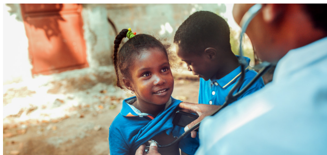
The George Institute for Global Health