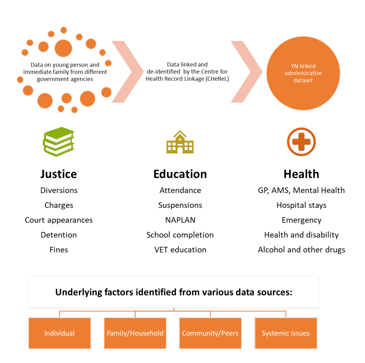
Figure 3: Yuwaya Ngarra-li data linkage framework

The diagram below illustrates what the final data linkage may consist of.