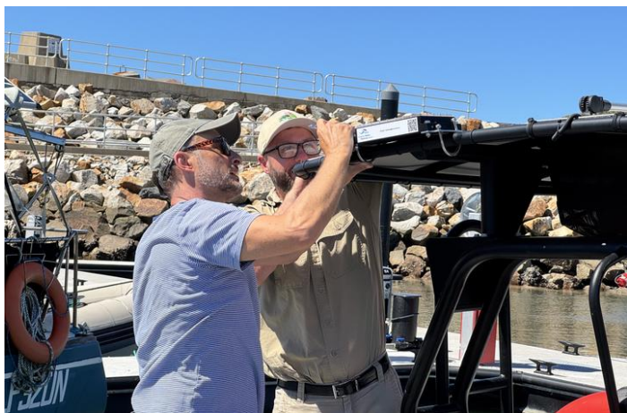
Sea Country rangers install the FishSOOP deck unit on Ranger 1.

We're delighted to announce that another vessel has joined the project through our collaborations with Sea Country rangers. Ranger 1, as the vessel is affectionately known, surveys the waters off Coffs Harbour, Gumbaynggirr country and is run in partnership with the Ngiyambandigay Wajaarr Aboriginal Corporation.