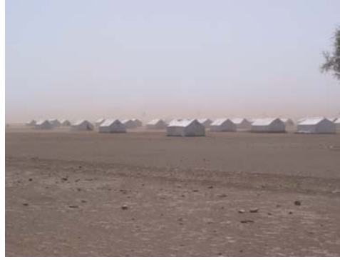
Kakuma Refugee Camp, Kenya