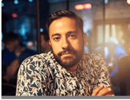
Recognise and Respond Online Course