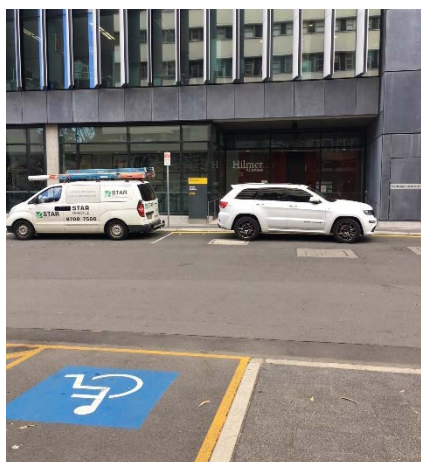
Ramp entrance on Union Rd opposite accessible parking